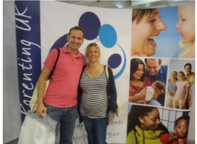
Above: Deaf Parents expecting their first twin!

Show, keeping Mums-to-be on trend throughout their pregnancy!