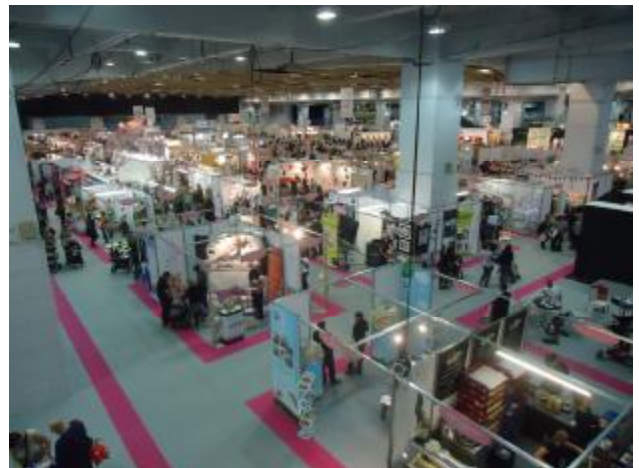
Above: The Baby Show, Earls Court