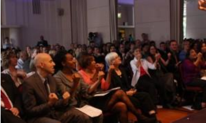
"So Strong" - Audience joined in the chorus...

summing up the feeling of the overall Awards Event.