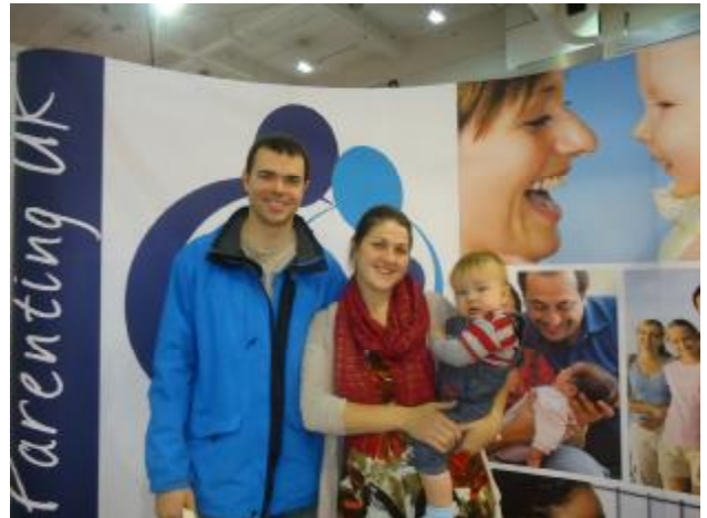
Above: Deaf Parents with child.